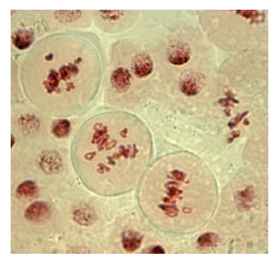
Figure 2 – Sticking of chromosomes in plants, treated with phosphoric acid

International Journal of Biology and Chemistry 9, No1, 19 (2016)