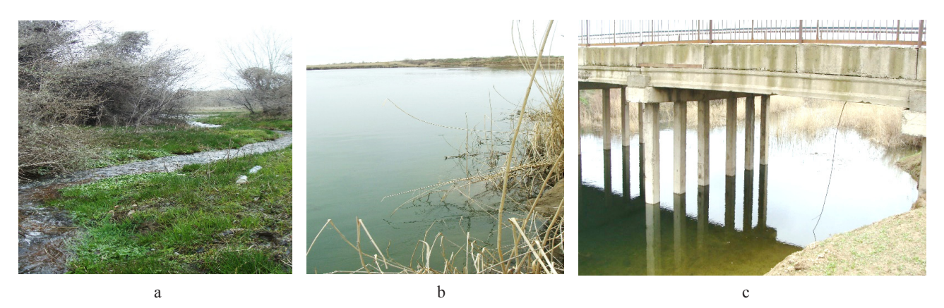
Figure 2 – Some of the sampling points: filtration stream at the foot of the dam of Shardara reservoir (A), shore near Kosseit village (B) and drainage collector near Sutkent village (C)

Point 13. Syrdaria at the bridge in the village of Baltakol. The water level is high. Coordinates: 43°09'32.0"/67°51'65.8". Sunken snags and plant stems were examined, brought by the current. The aquatic phases of blackflies development were not detected. In the air, one adult male blackfly is caught.