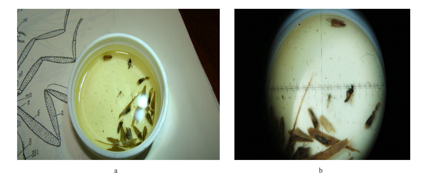
Figure 3 – Pupae of W.turgaica in general view (A) and under x6 magnification (B)

The collected material shows that local populations of these species hibernate in the phase of the larva, their pupation and emergence take place in the II – III decade of March. By this time B. erythro cephala managed to fly out completely – left empty cocoons and puffed skins- exuvia. Gab of W. turgai ca finished in the southern, adjoining the reservoir are part of river channel (point No. 2) and continued in the more northern part of the length (points No. 3 and 4).