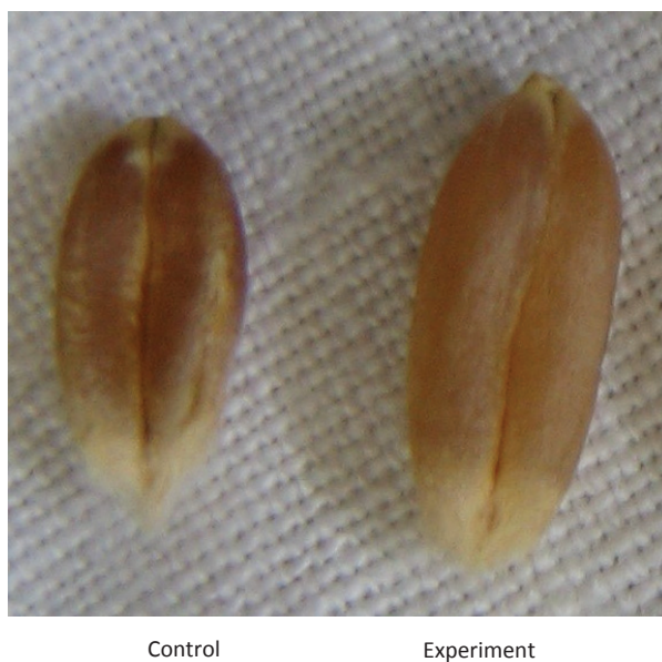
Figure 5 – Control and experimental grain

basis of pubescent leaves used as a donor line with the clutch 3 characteristics: pubescence of the leaf blade and the ear, the presence of anthocyanin ears. All the signs were the dominant mode of inheritance. In the selection of the desired genotypes in fissile generations of hybrid F 1 plants, we were able to select plants are phenotypically similar to the recurrent parent with inherited sign of interest – pubescent leaves. According to the lines backcrossing is being made with careful selection of plants on the marker.