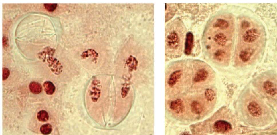
Figures 3, 4 – Cells without and with the micronuclei in tetrads

Marking of Kazakhstanskaya 126 variety for a number of morphological traits. For morphological marking of soft wheat Kazakhstanskaya 126 variety, isogenic line Saratovskaya 29 genes Hg , Bg , C , Pr , Eg , Hp , B , Rht , Pc , W , Ra , Pa , kindly provided to us by O.I. Maystrenko (ICG SB RAS, Novosibirsk) were used as the donor marker signs.