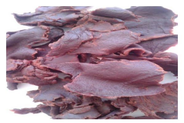
Figure 1 - Dried Tomato Mass

the resulting product has a burgundy color. Figure 1 shows the object of study.