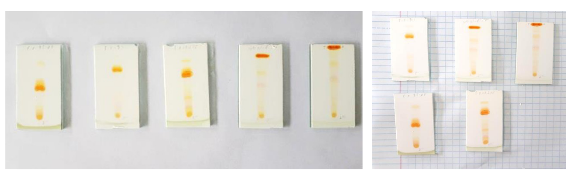
Figure 2 - Analysis of carotenoid concentrate from tomato mass by thin layer chromatography

Of all the tested solvents, the optimal extractants were: methyl chloride, acetone and chloroform, since the carotenoids are most completely extracted in these solvents.