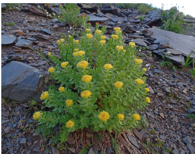
Figure 1 – Altai's R. rosea . Flowering stage. Kazakhstan, East Kazakhstan region, the northern slope of the Ivanovsky Belok ridge, 1800 m. above s.l., August 2017.

Research was carried out in the Laboratory Ecology of the Biosphere, RSE Al-Farabi KazNU, SSE Center for Physical and Chemical Methods of Research and Analysis, and Laboratory of plant anatomy and morphology, Al-Farabi KazNU (Figure 2).